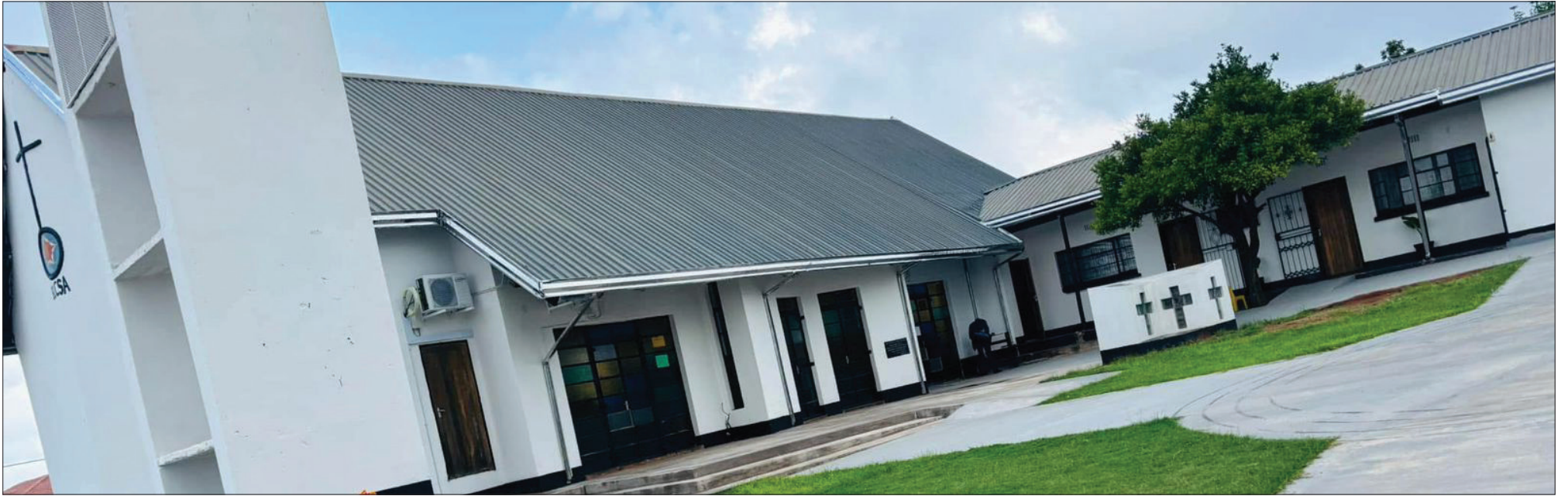
Scores of congregants at Motetema Lutheran Church protested to submit a petition, calling for the resignation of the church’s Congregation Council over maladministration.