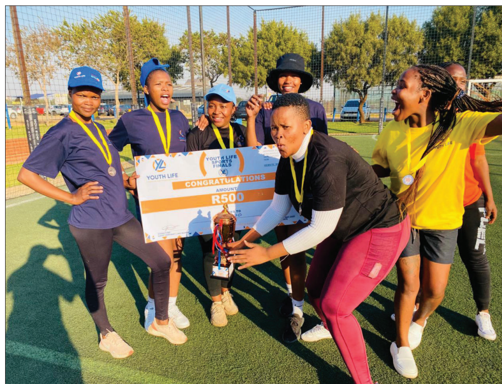
Ipopeng Cultural Group NC walked away with prizes and awards after obtaining the third position during the Youth Life Soccer National Champions organized at the Rietvlei Zoo Farm in Soweto.