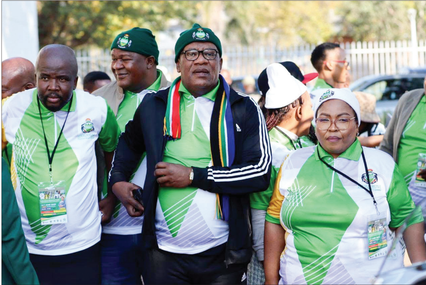
MEC for Sports, Arts and Culture, Jerry Maseko, SDM Executive Mayor, Cllr Minah Bahula, with Fetakgomo Tubatse Local Municipality (FTLM) Mayor, Cllr Eddie Maila, moving across different sporting fields during the IMSSA Games at Groblersdal Rugby Stadium.