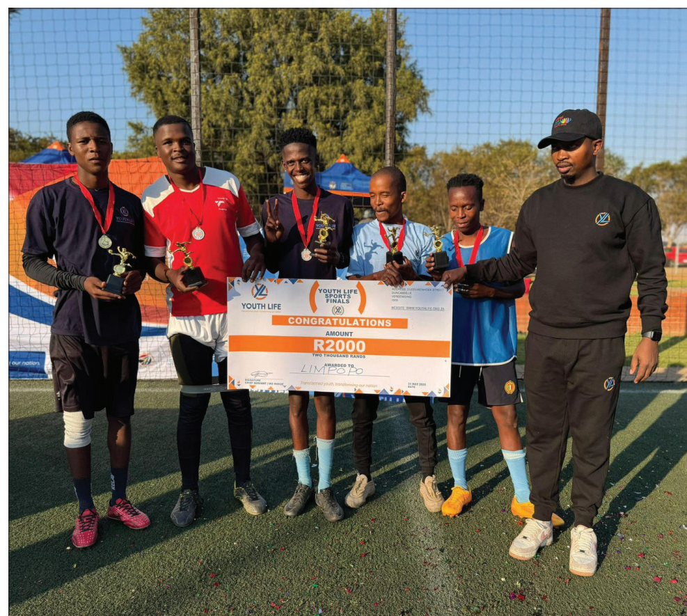
Ipopeng Cultural Group FC with the trophy and awards they won during the Youth Life Soccer National Champions held at Rietvlei Zoo Farm in Soweto.

"I am truly proud and honoured to have led a winning team from Ipopen Centres in Dikgalaopeng and Mpheleng. I pride myself with their commitment, passion and