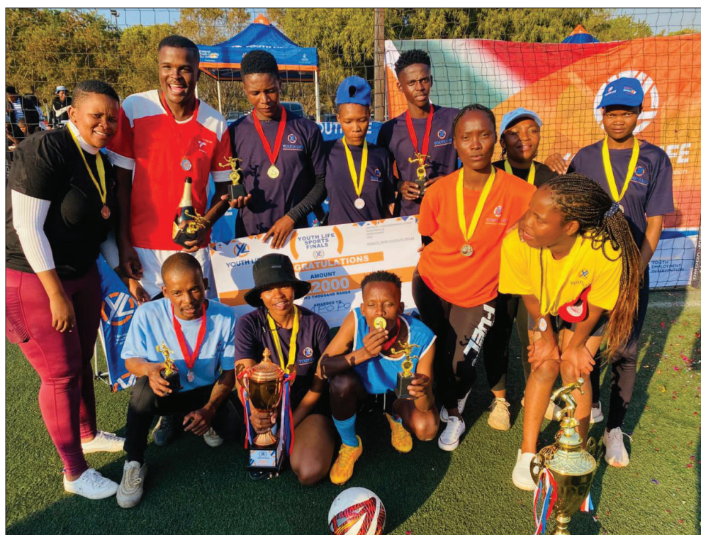
Ipopeng Cultural Group football and netball teams were awarded various prizes after excelling in the Youth Life Soccer National Champions held at Rietvlei Zoo Farm in Soweto.