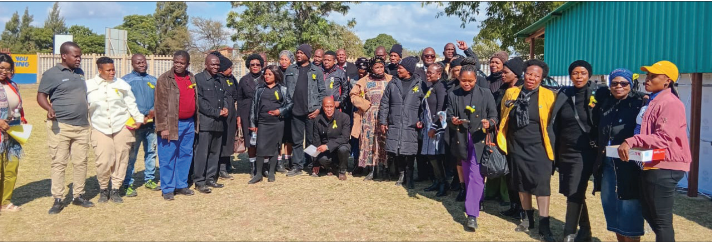
Dignitaries and stakeholders from government and private sector converged to attend the World Menstrual Hygiene Day which was celebrated at Rite Primary School in Tafelkop.